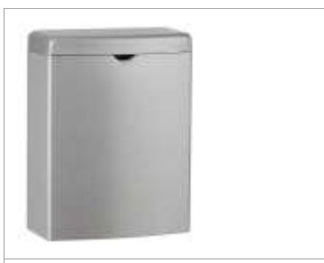
Bobrick B-270 ConturaSeries®